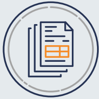
Loan Status Reports