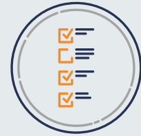
History of Ineligibles