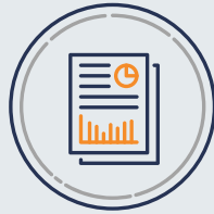
Loan Ledger Reports