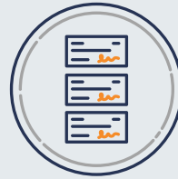
History of Interest Statements